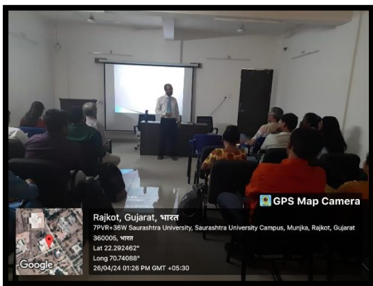
GPS Map Camera Rajkot, Gujarat, भारत 7PRR+30W Saurashtra University, Saurashtra University Campus, Munjka, Rajkot, Gujarat 360005, भारत Lat 22.292462° Long 70.740988° 26/04/24 01:26 PM GMT +05:30